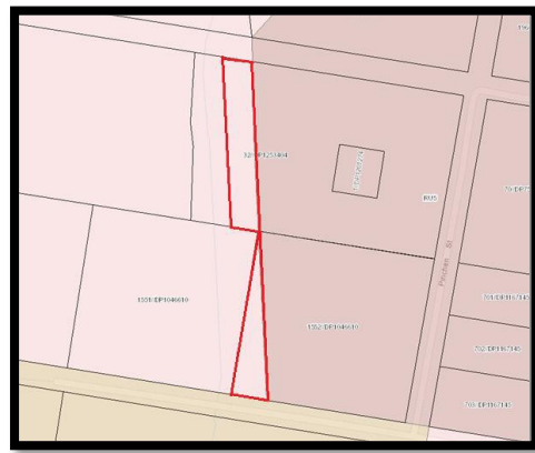
Figure 2: Land subject to the amendment